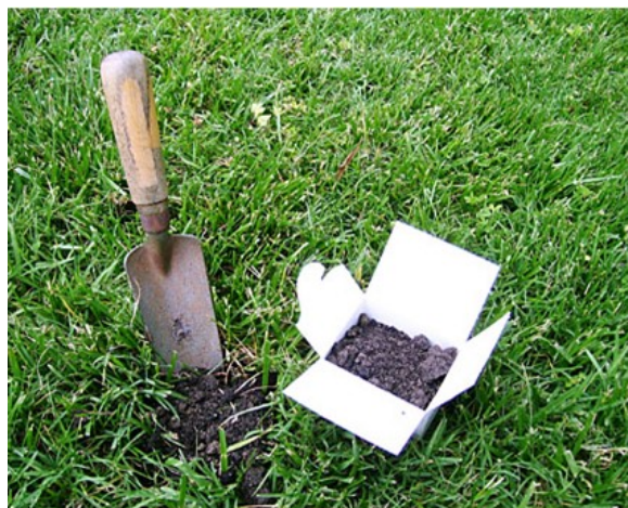
Have your soil tested.