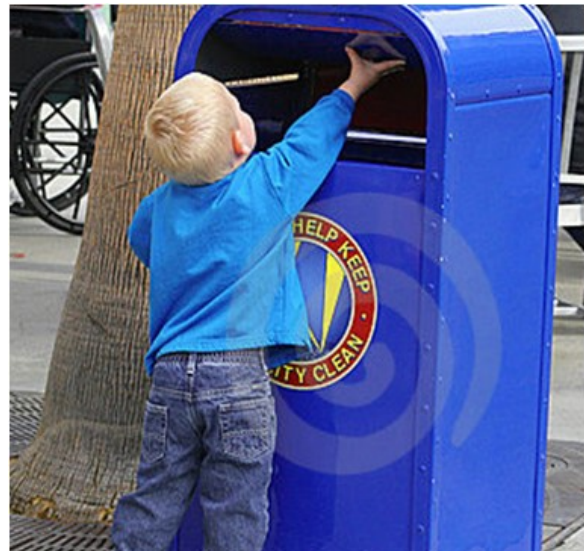
Put trash in the trash can.