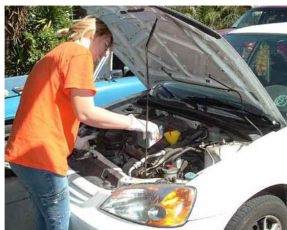
Keep your car in good shape.