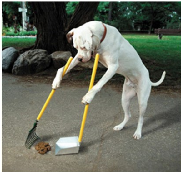
Pick up after your pet.

Here are some very simple things we can do to reduce or prevent non-point source pollution: